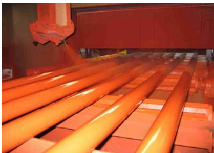
High-end painting process. Clean working environment. Considerable savings on paint. Reduced energy consumption.