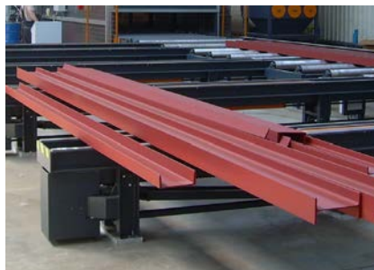
Highly efficient coating techniques for the protection of sophisticated, sustainable steel products.

Committed support and professional advice